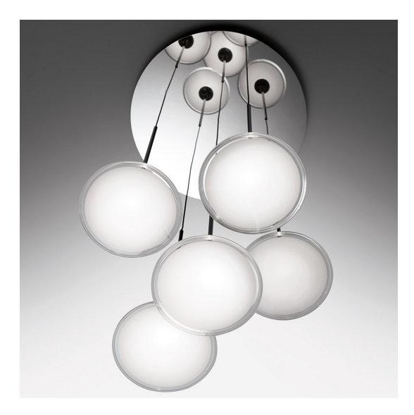
IP 20 (€) (€) Dimmerable: +① -