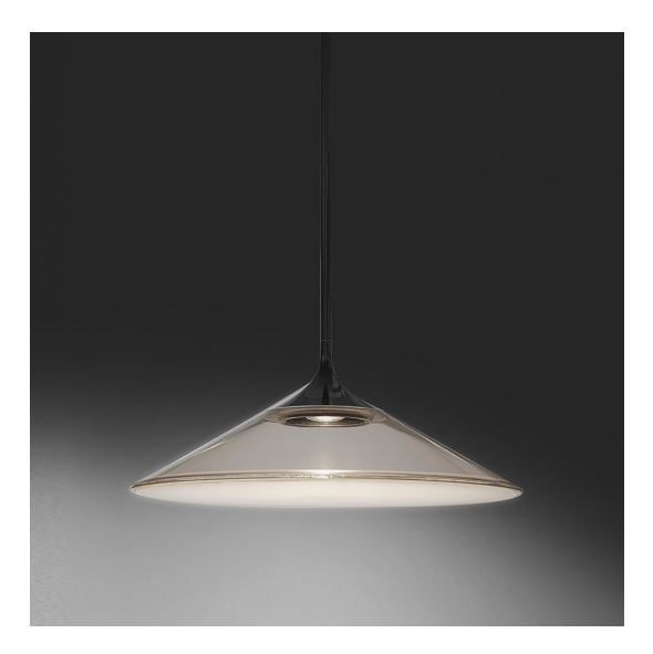
IP 20 (€) (€) Dimmerable: +① -