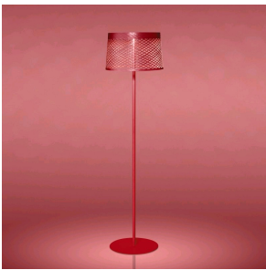
Twiggy Grid Lettura