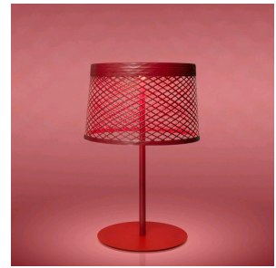
Twiggy Grid XL