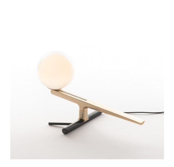
IP20 🕸 🏽 C E