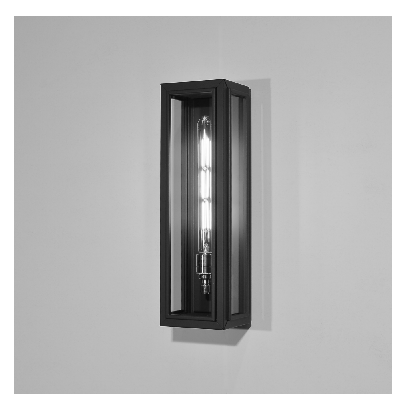
WINDSOR WALL LIGHT for Interiors & Exteriors