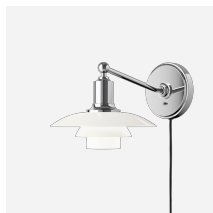
PH 2/1 Wall