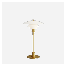
PH 2/1 Table