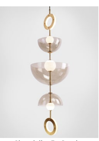
Chandelier 5 - Smoke