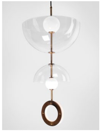
Chandelier 3B - Clear