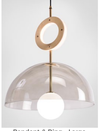
Pendant & Ring - Large, Smoke