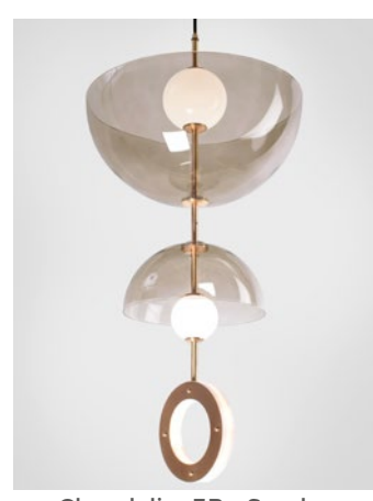
Chandelier 3B - Smoke