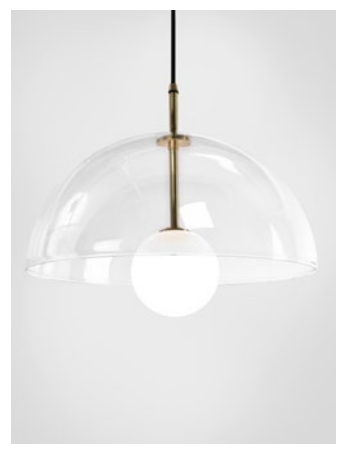
Pendant - Large, Clear