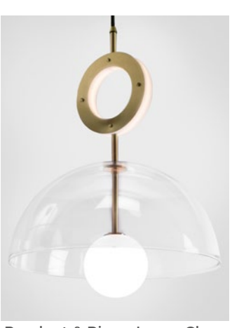
Pendant & Ring - Large, Clear