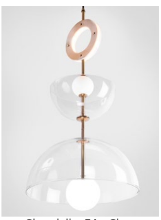
Chandelier 3A - Clear