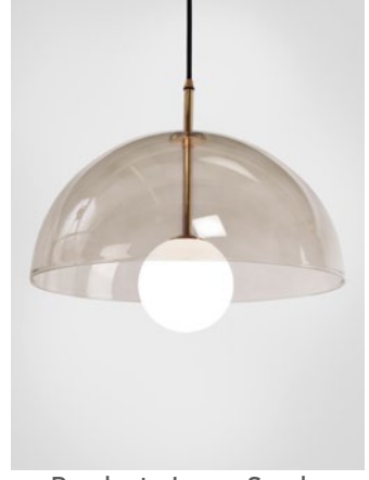
Pendant - Large, Smoke