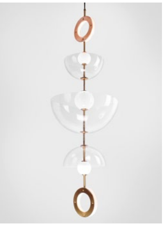
Chandelier 5 - Clear